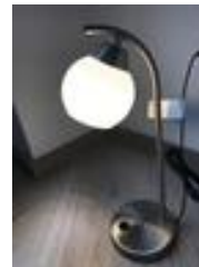
Electricity costs (usually pay to provider yourself)

Additional costs: Facility manager, Insurance for the house, General current TV