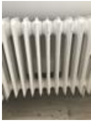
Costs for heating