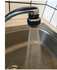
Costs for water

Additional costs: Facility manager, Insurance for the house, General current TV