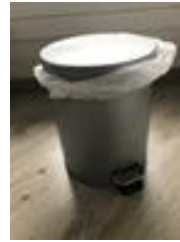
Costs for garbage